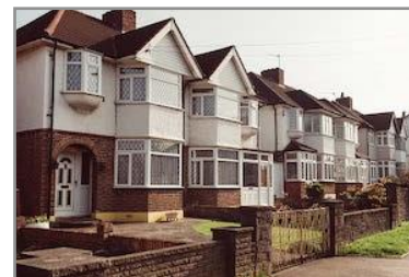
homes built in the past

Comparing and contrasting homes then and now: