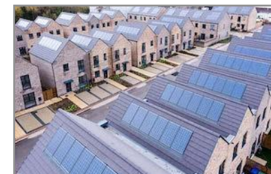
homes built recently